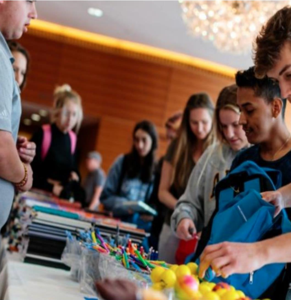
Lynn students actively participate in the Citizenship Project.