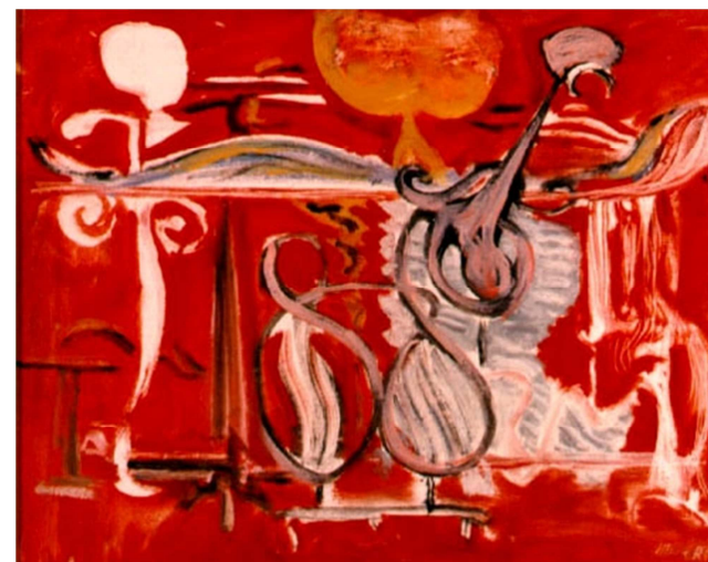
Red Abstract, Mark Rothko

When talent meets inspiration, the results are extraordinary.