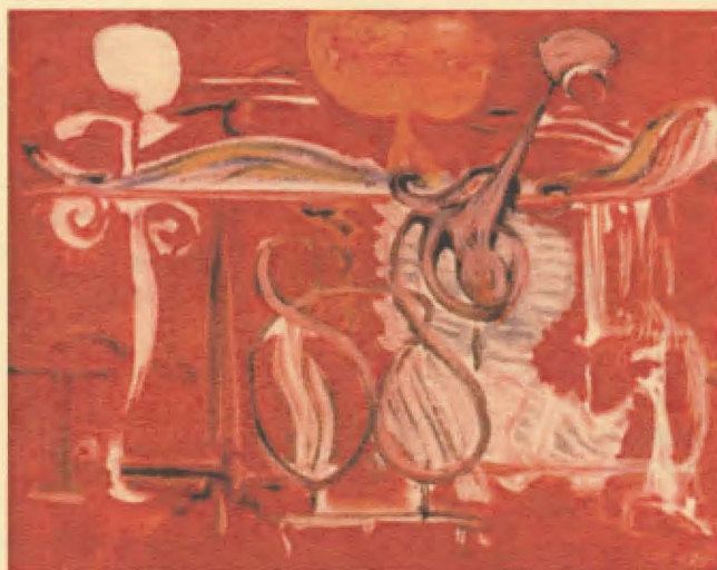
Red Abstract, Mark Rothko

When talent meets inspiration, the results are extraordinary.