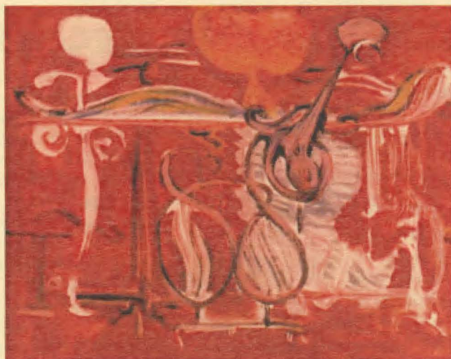
Red Abstract, Mark Rothko

When talent meets inspiration, the results are extraordinary.