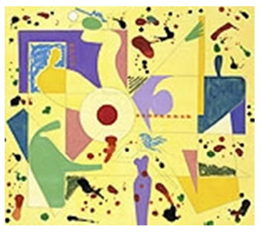
Jazz Extract, Gil Mayers

When talent meets inspiration, the results are extraordinary.