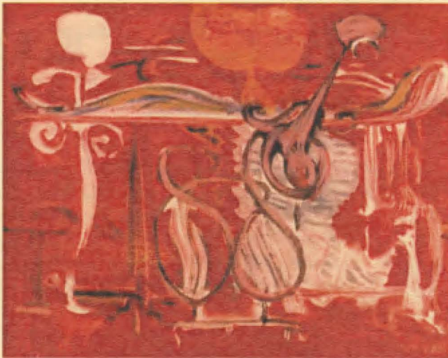
Red Abstract, Mark Rothko

When talent meets inspiration, the results are extraordinary.