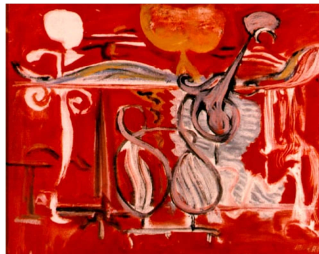
Red Abstract, Mark Rothko

When talent meets inspiration, the results are extraordinary.