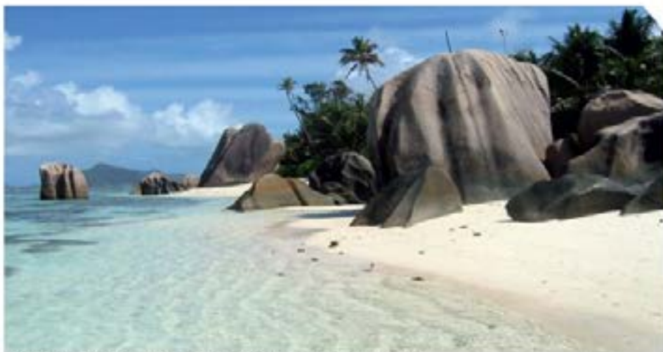
The island is surrounded by beautiful bays and white beaches protected by coral reefs