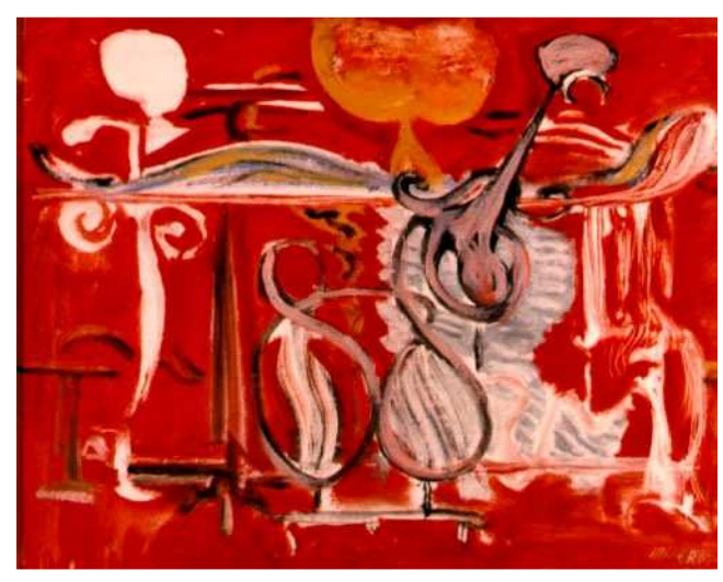
Red Abstract, Mark Rothko

When talent meets inspiration, the results are extraordinary.