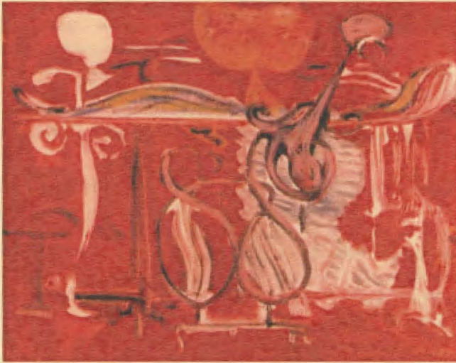
Red Abstract, Mark Rothko

When talent meets inspiration, the results are extraordinary.