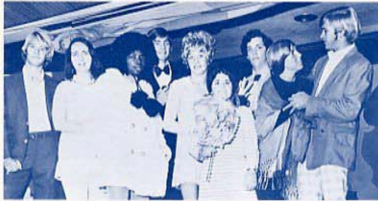
MEMBERS OF "LAUGH-IN" CAST