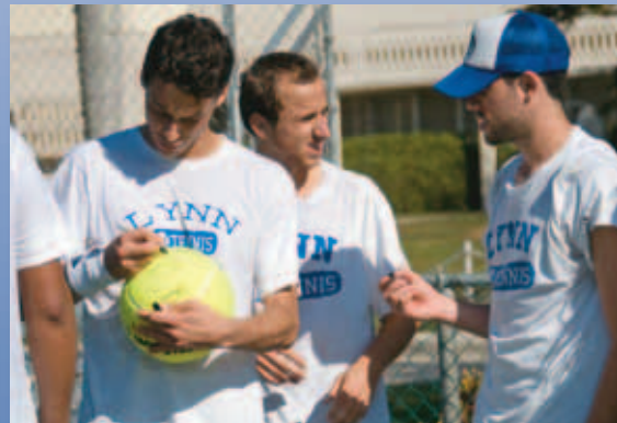
The men's team lines up to sign the tennis balls.