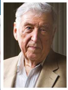
Gunther Schuller, 2011 Artist-in-Residence