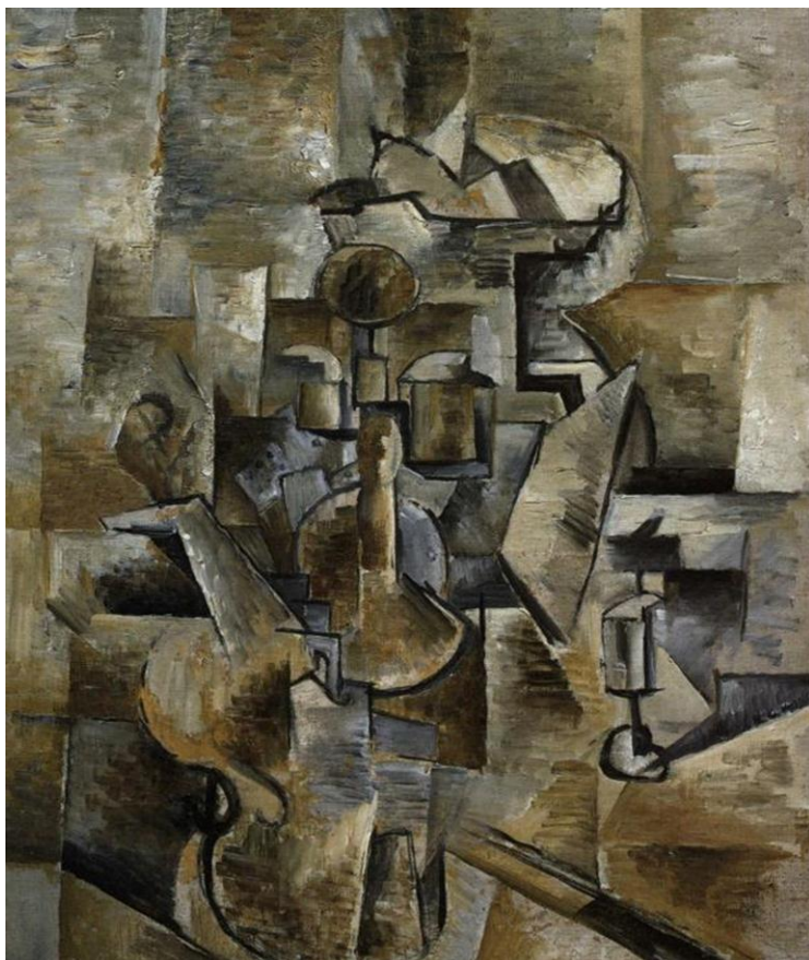
“Violin and Candlestick, 1910 by Georges Braque”